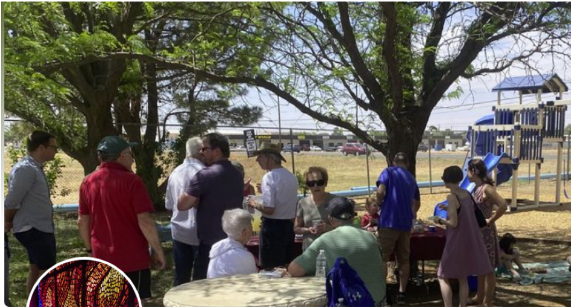
Congregation Shaareth Israel

We are on Facebook! Check us out! Or at csitemple.org